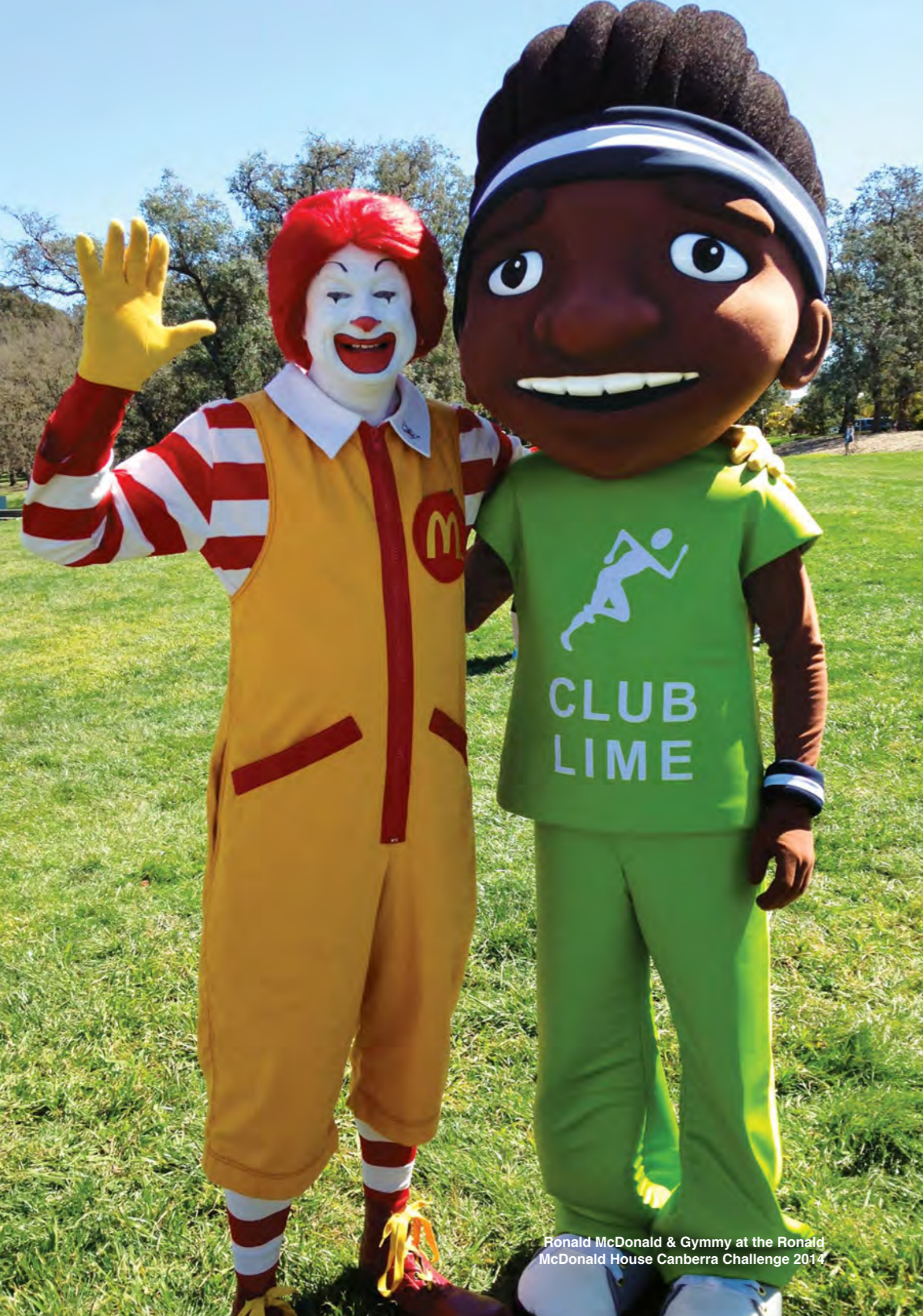
Ronald McDonald & Gymmy at the Ronald McDonald House Canberra Challenge 2014