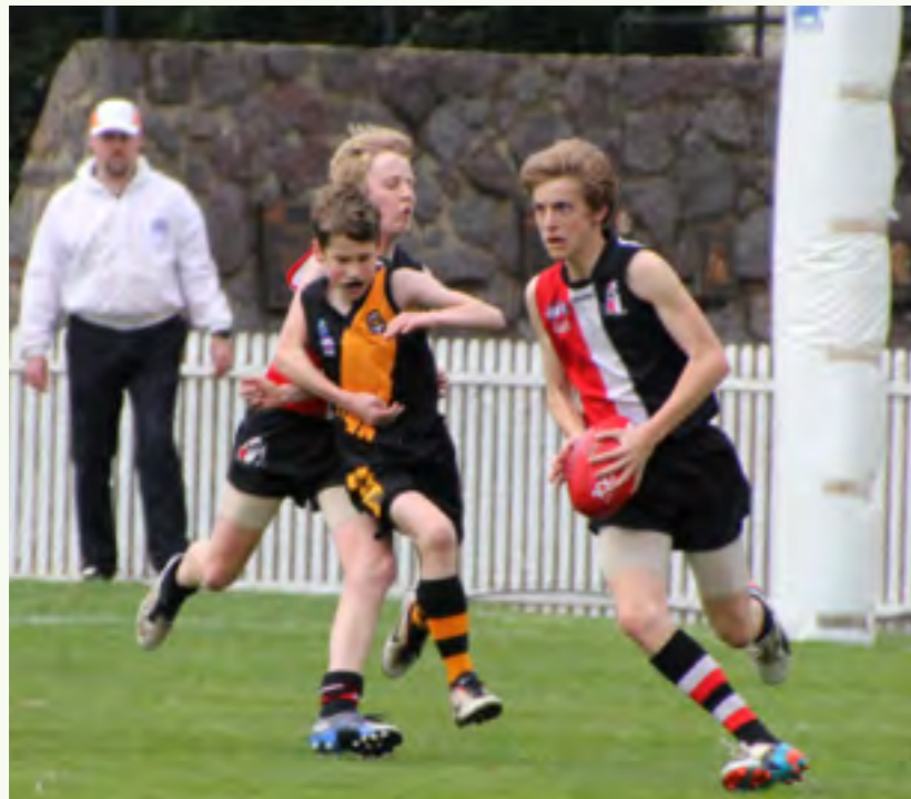
Ainslie Junior Football Club

We are a new partner with the Club Group, however the generous sponsorship for gymnasium membership and the availability of expanded training and rehabilitation facilities will improve our senior and junior fitness and recovery. The financial support will ensure that we are able to keep striving to provide best possible product to our participants.