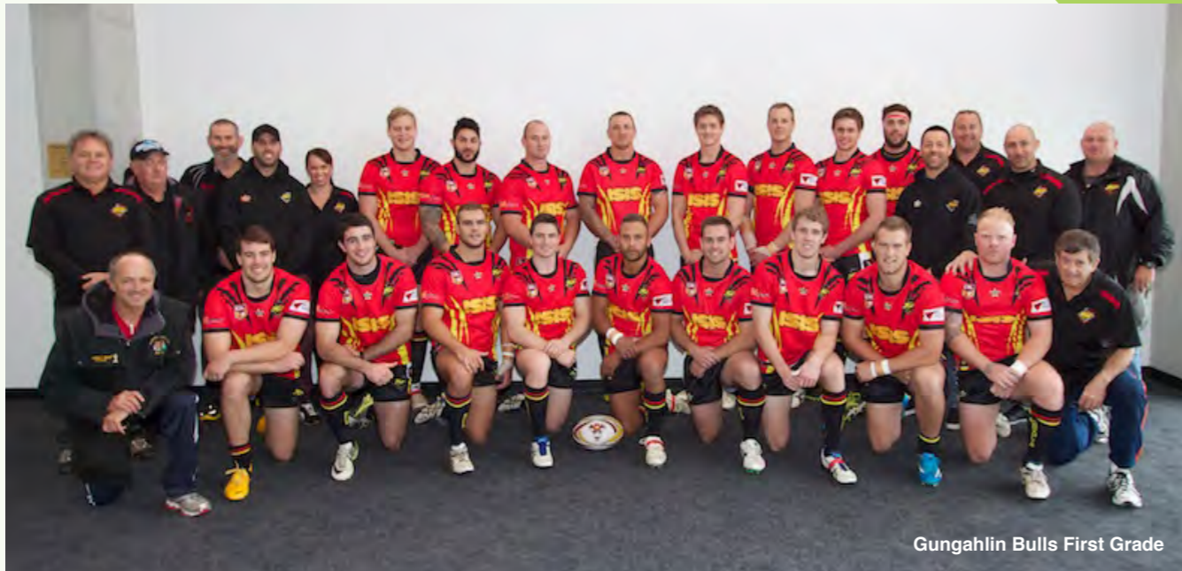
Gungahlin Bulls First Grade

www.facebook.com/pages/Gungahlin-Bulls.../176963055749626