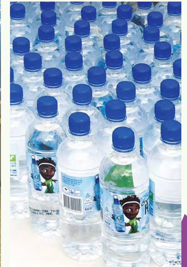
Club Lime provided bottled water to all the participants of the Verti Cool Challenge

Our organisation is a children's cancer charity we run resilience building camps and children living with cancer.