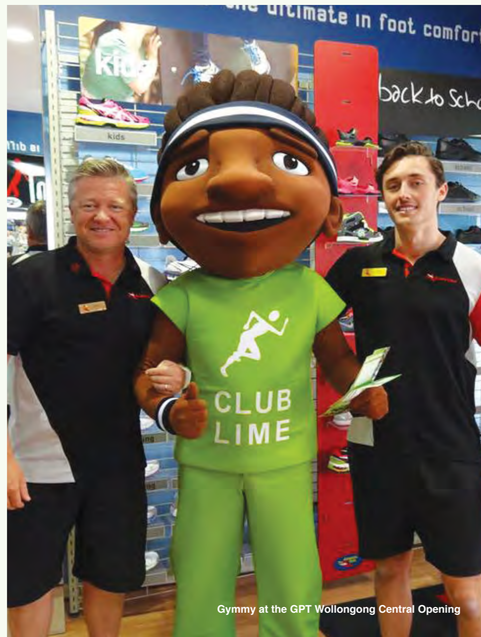
Gymmy at the GPT Wollongong Central Opening