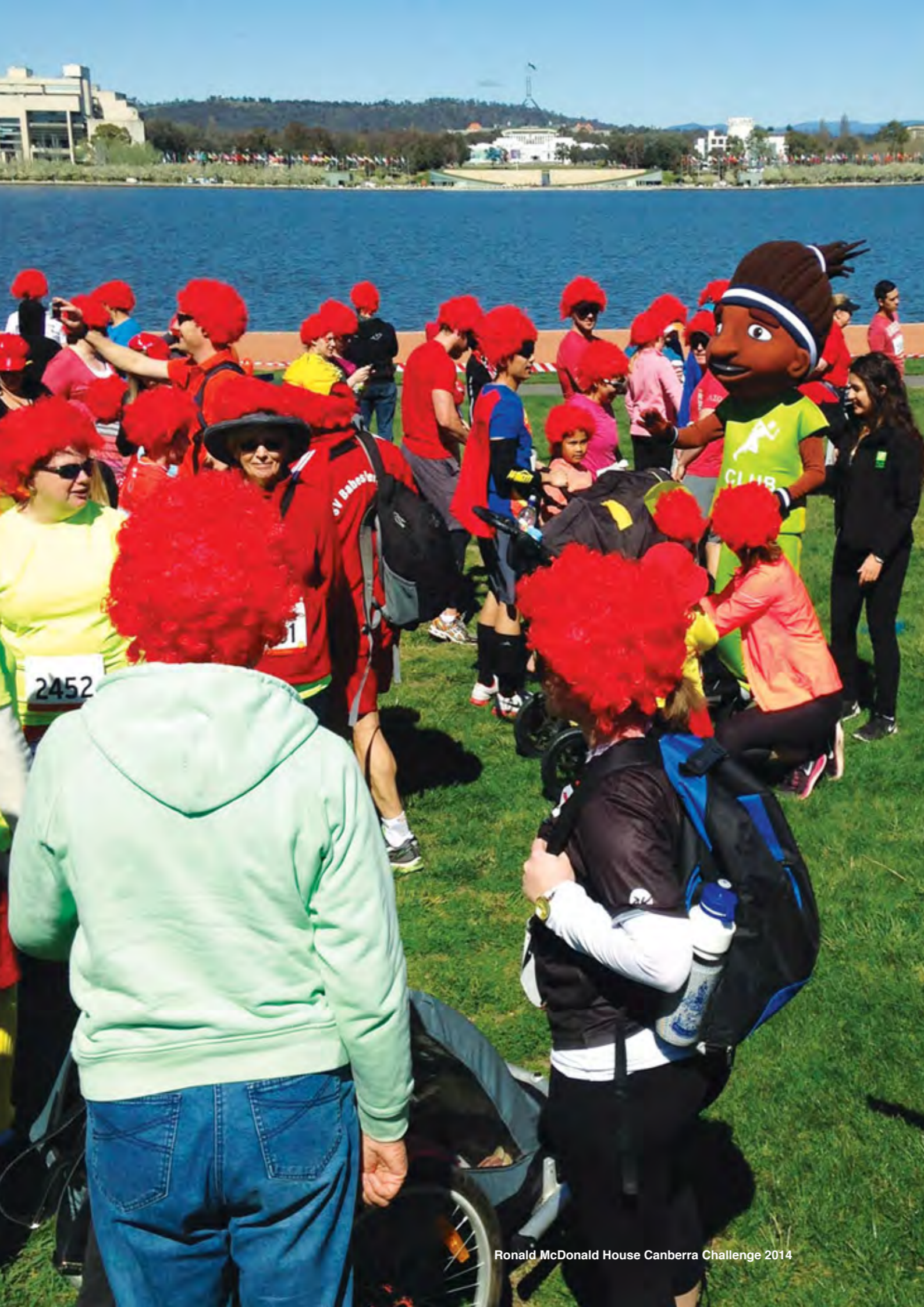
Ronald McDonald House Canberra Challenge 2014